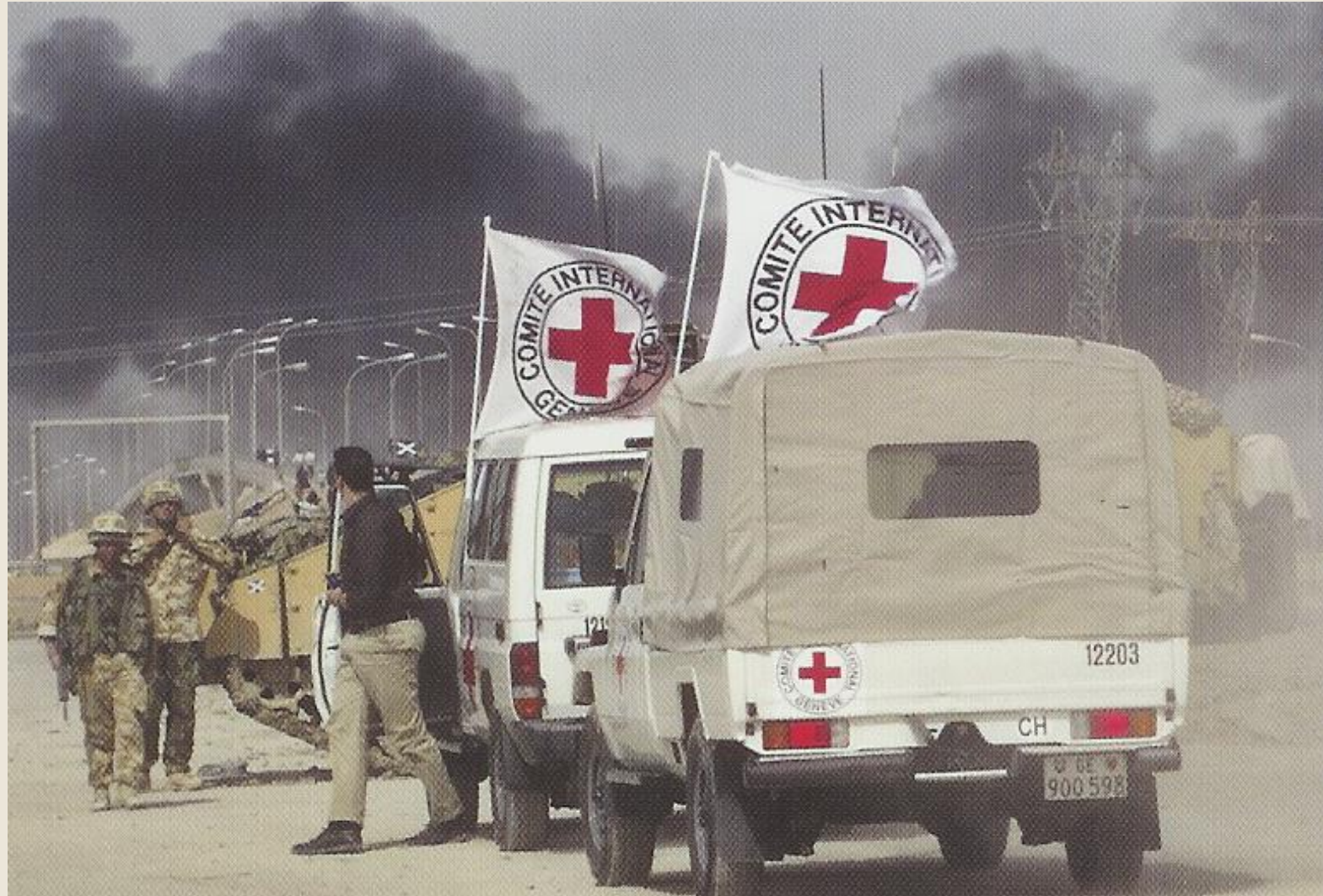
Unit for Relations with Arms Carriers