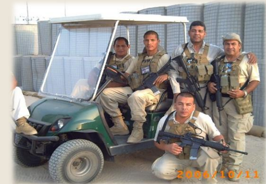
Other Security Actors