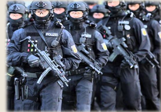
Law Enforcement Agencies