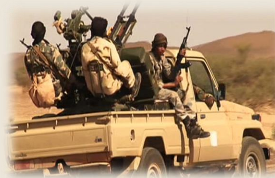
Non-State Armed Groups (NSAG)